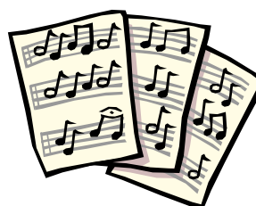
Women's Committee for Children's Concerts Art Contest 2010