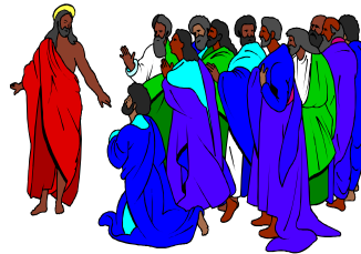
April 12-April 16

We appreciate all the donations of materials that we have received for the Bible Fair.